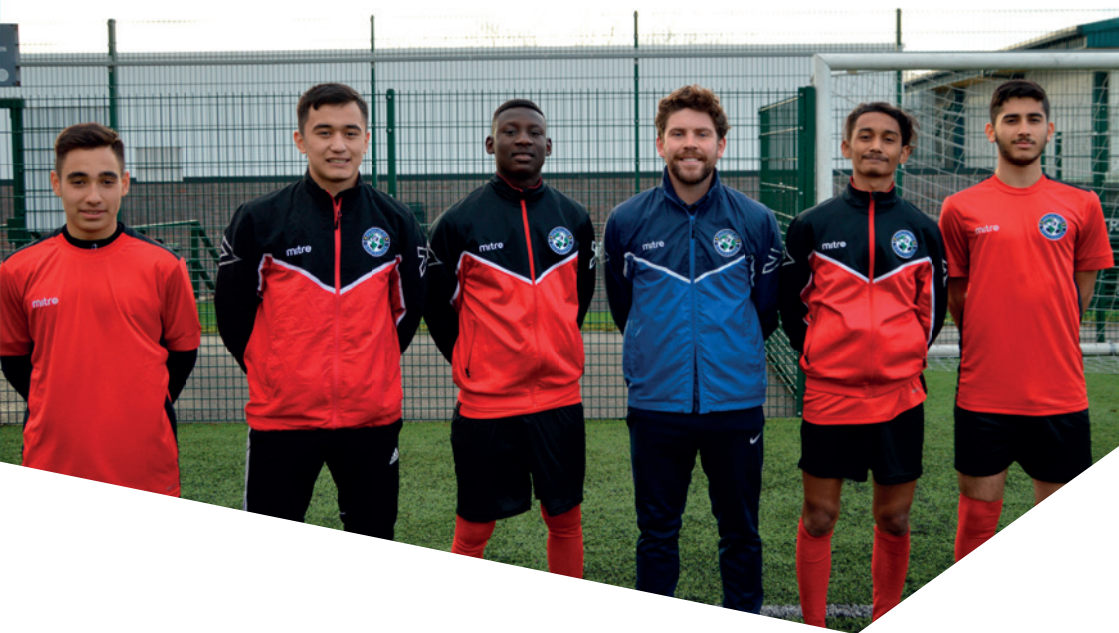
ABB COLLEGE MANCHESTER