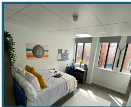
Standard En-Suite Room

These are large rooms with even more space and have a separate study area, including an armchair. Preferences should be requested at point of booking. *But please note that preferences can not be guaranteed*