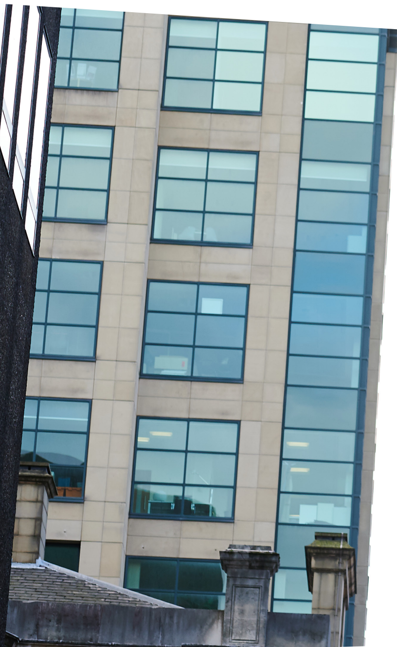
ABB COLLEGE MANCHESTER

Abbey College Manchester 5-7 Cheapside, Off King Street, Manchester, M2 4WG T: +44 (0)161 817 2700 E: admin@abbeymanchester.co.uk www.abbeymanchester.co.uk