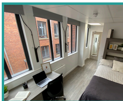
Deluxe En-Suite Room